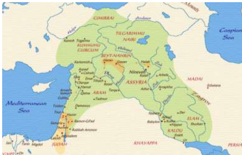
The Assyrian Empire

Background The Assyrian Empire dominated the Middle East in the middle of the seventh century BC. Nineveh was the capital city of Assyria and had repented of its sin and turned to the Lord under Jonah. It wasn't long after this, though, that the Assyrians fell back into sin and rebellion against God. Nahum prophesied that God would judge the city for its sin and would destroy it. The prophecy was fulfilled when Nineveh was destroyed in 612BC by Nebopolasser, the father of Nebuchadnezzar.